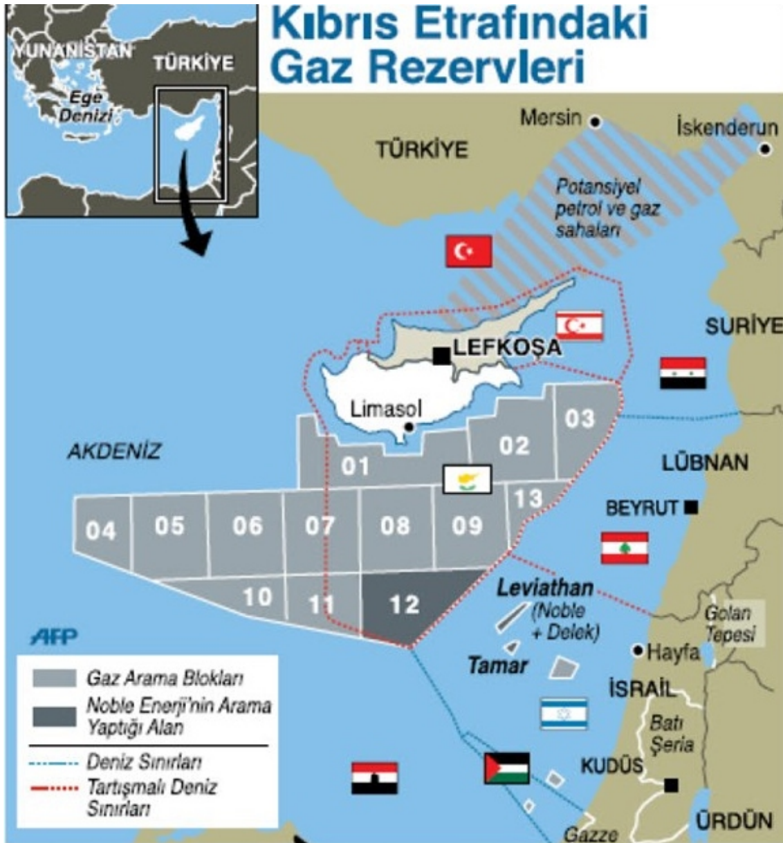
Natural Gas Reserve Areas in Eastern Mediterranean (Karaçin,2012:10-11)

Cypriot Administration) are conducting oil and natural gas research in this area. In 2007, the Greek Cypriot Administration separated its self-declared exclusive economic zone into 12 sectors and granted permission to the companies American Noble, Italian ENI and French Total to do research. These decisions of the Greek Cypriot Administration, which positions itself as the sole representative of the island, are contradictory to the current status. It has made agreements with Egypt and Israel in the field of energy, despite the fact that it does not have unilateral power to make decisions regarding the islands administration and to make international agreements.[3]