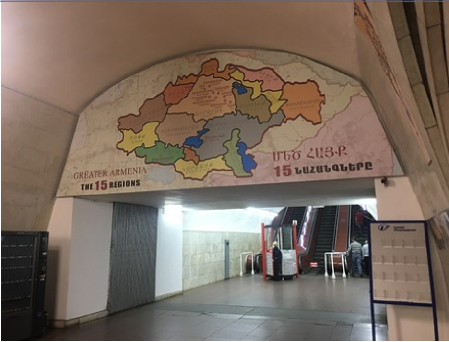
A map in a Yerevan metro station, displaying the territories of Azerbaijan, Turkey, Georgia, and Iran as part of a Great Armenia.