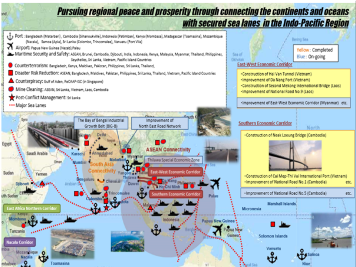
Source: The Government of Japan, Towards Free and Open Indo-Pacific, November 2019 ( https://www.mofa.go.jp/files/000407643.pdf ).