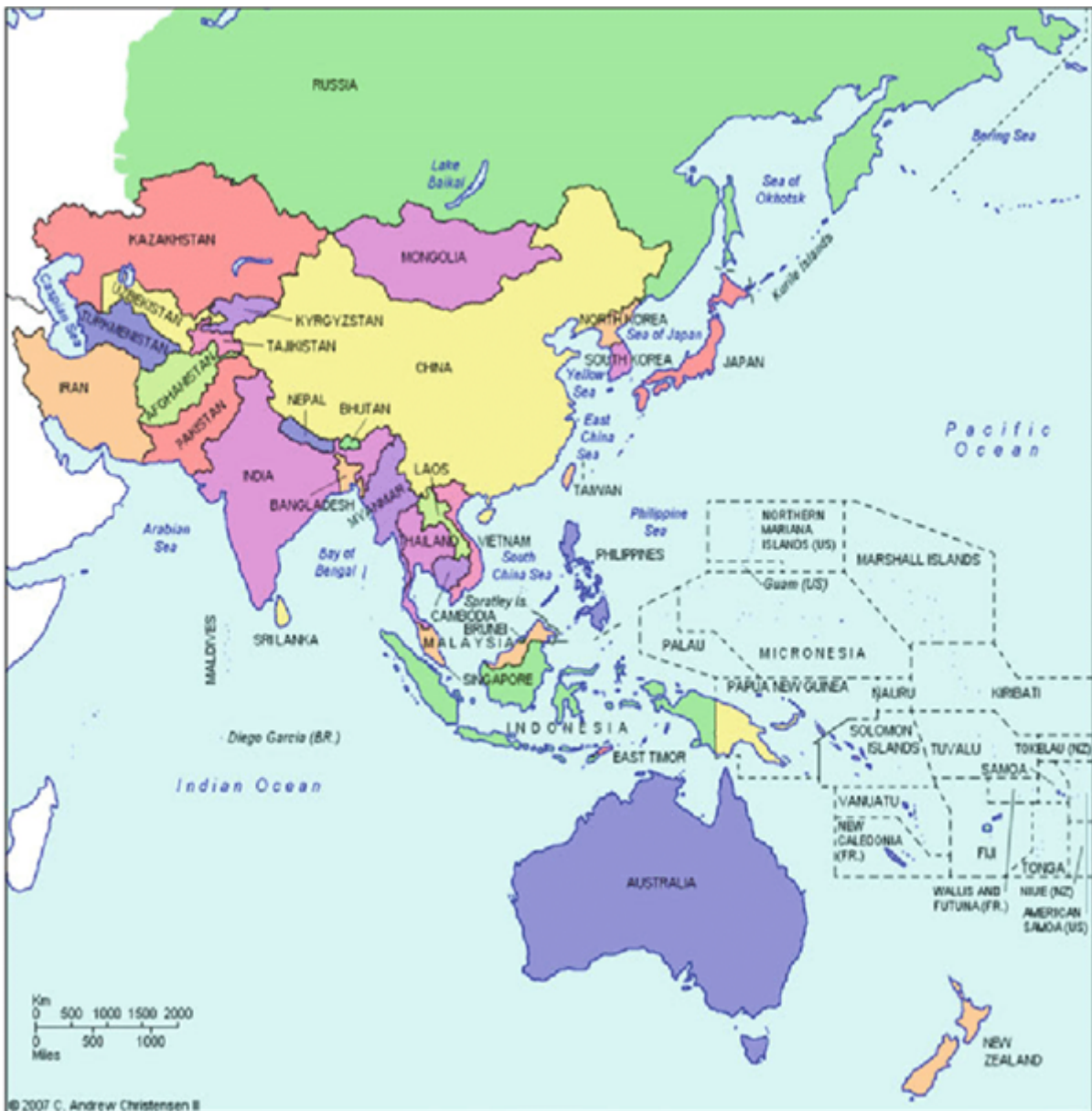
Figure: Map of the Asia-Pacific